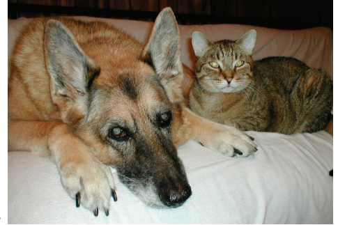
Shadow and Cougar

Today, I received a call from a fellow rescue person, one that I met, quite by chance, on the side of Highway 11 last Fall as he so kindly pulled his pick-up truck to the side of the road to help me rescue a very cranky snapping turtle (may sound strange but welcome to my world). He was calling to ask how I would suggest that they (another no-kill shelter that PAWS is fond of and works in conjunction with whenever possible) reduce the number of cats in their care as they simply can't keep up.