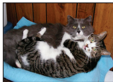
Smoke and Winky

Please feel free to network on our behalf by telling friends about PAWS, sharing our newsletter and, in turn, helping us to spread our message of kindness and compassion. PAWS Volunteers welcome you to make a donation in memory of a loved one or in honor of a special occasion. Feel free to do so via snail mail or securely via www.pawscanada.org . THANK YOU.